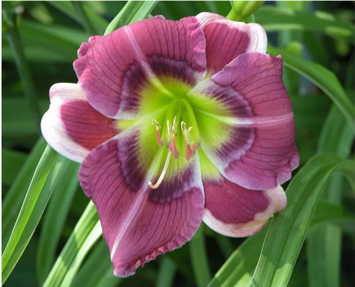
Rosabella Von Valkenberg texture texture