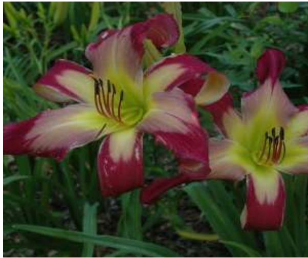
DAYLILY WITH SILVER EYE