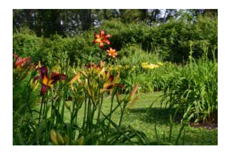
Daylilies with companion plants