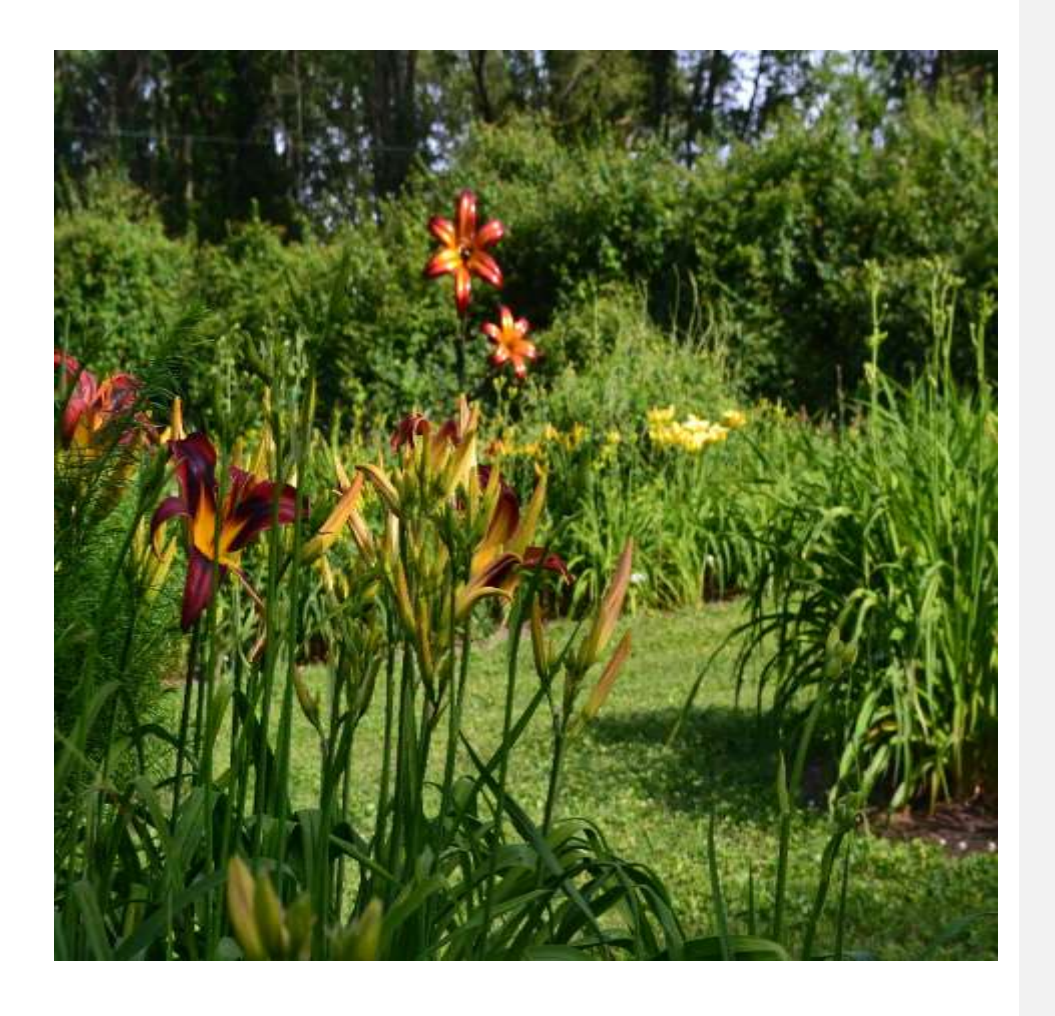
Daylilies with companion plants